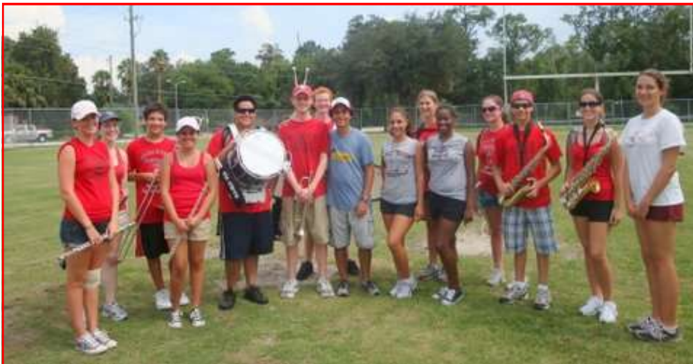
Band Leadership during 2 full days of training before Rookie Days

With every student paying their Fair Share, the band can afford to offer Seniors free admission to the Band Bandquet, and offer $10 off to underclassmen. If the funds are not in the account, we can't afford to offer this discount. So you see, if we all take responsibility for our Fair Share of the fees, everyone benefits.