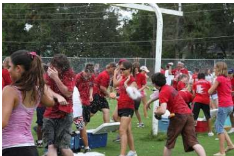
Water balloon fight at band camp. See it all on the Band Camp DVD!